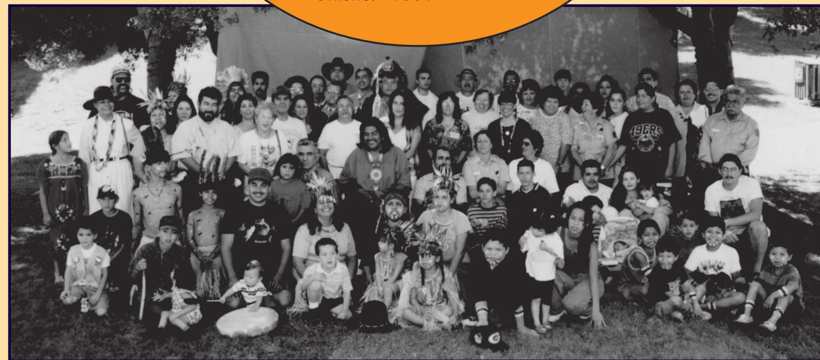
Ohlone Families, Gathering of Ohlonean Peoples, Coyote Hills Regional Park, October 6, 1996.